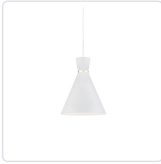
493210-WH/GD White with Gold detail